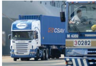
Maritime appointed sole contractor to CSAV

Welcome to Fast Forward. Read about the latest developments at Maritime Transport.