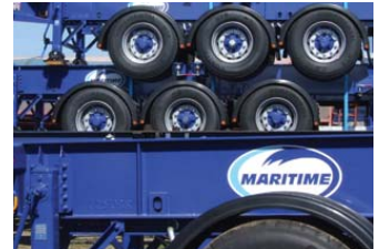
Bumper order boost trailer fleet