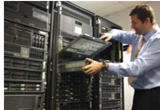
I.T.'s all about performance